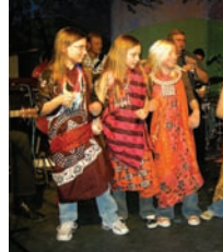
GUNNISON ARTS CENTER