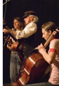
GUNNISON ARTS CENTER