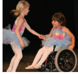
CB SCHOOL OF DANCE